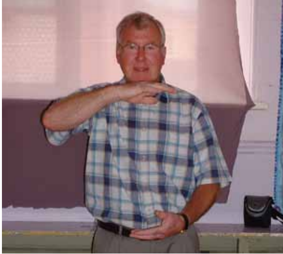
Rolling a beach ball