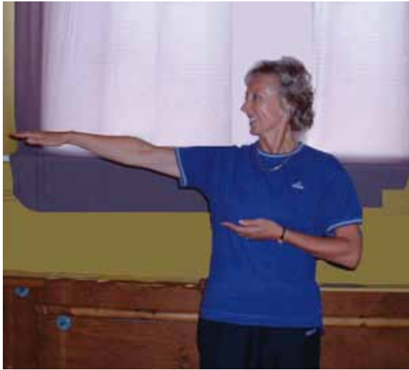
Sideways arm stretch