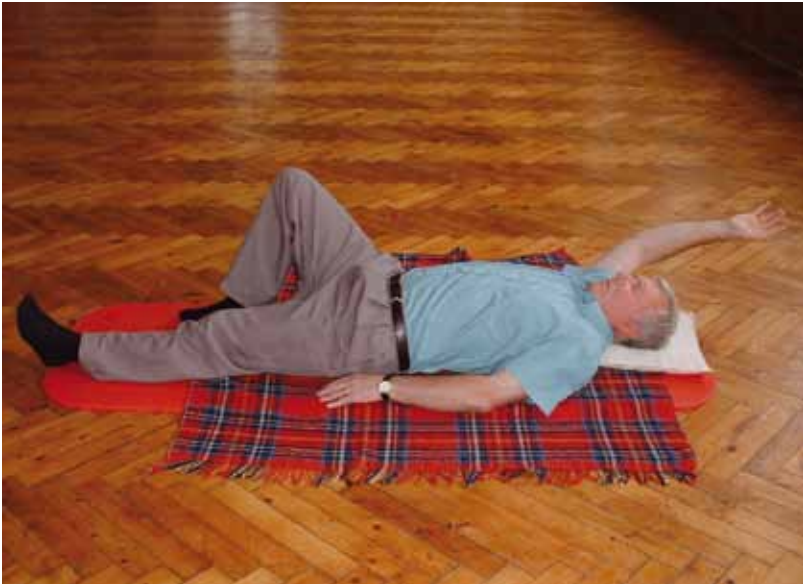
Arm and leg stretching