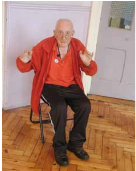
Modified trunk rotations